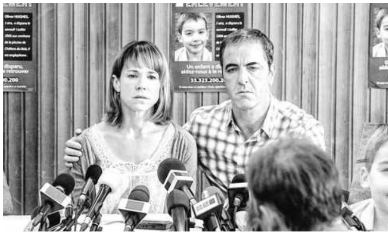
After their son vanishes, the relationship between Emily (Frances O'Connor) and Tony (James Nesbitt) suffers.

"There is something about that topic that rivets people, because